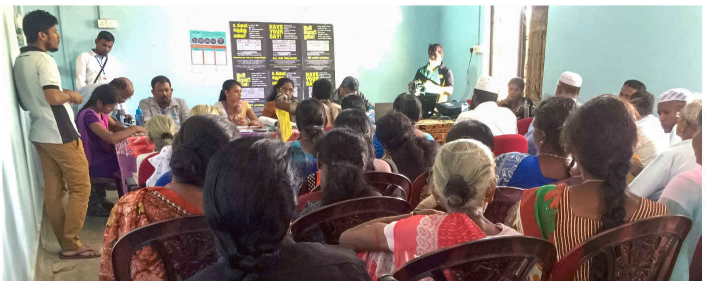
Consultation Task Force for Reconciliation Mechanisms Photo